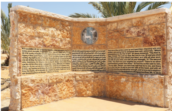
Top: The Eastern Bank of the River Jordan. Above: The Station at the Catholic Cathedral.