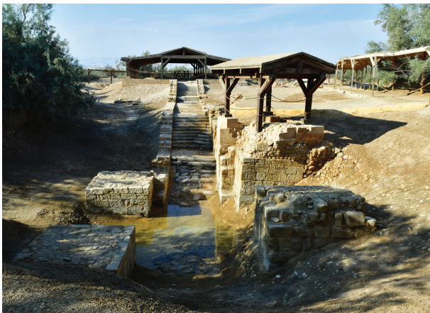
Top: The five Memorial Churches. Left: The Station at the site of the Baptism of Jesus Christ.