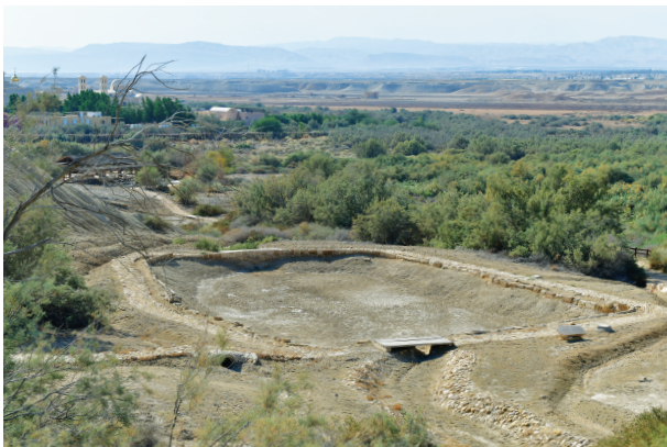
Top: The Large Pool. Left: The Station at the Large Pool.