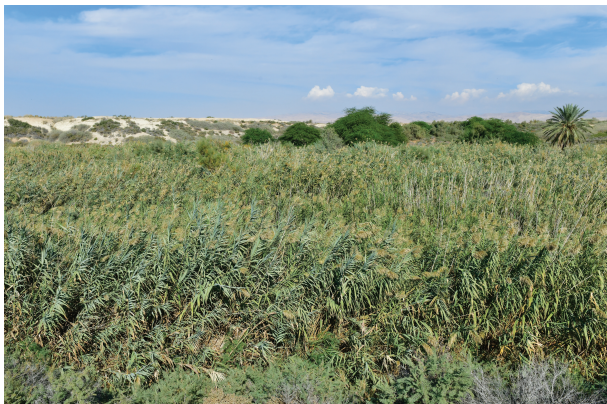
Top: Wadi El-Kharrar. Left: The Station at Wadi El-Kharrar.