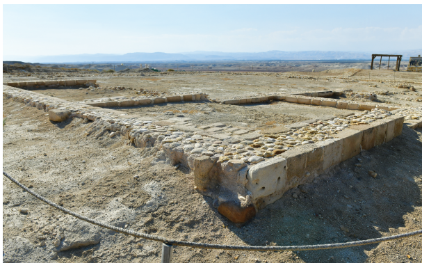
Top: The stones at the Pilgrimage Station, situated between the Jordan River and Tell El-Kharrar.