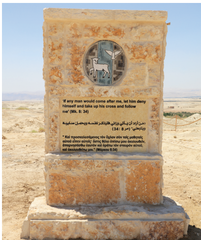
Left: The Pilgrimage Station.